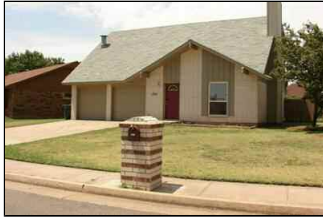
721 Holly Hill Rd

Your Hometown Realtor, Finding you a place to call HOME!