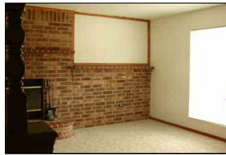
large living area with Fireplace