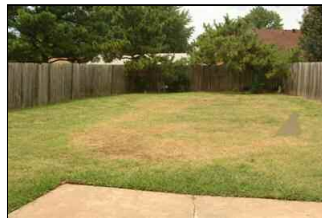
Large back yard with fencing