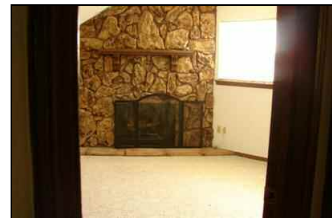
Master with Fireplace