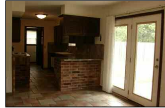
French Doors leading out to back yard