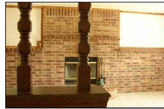
Fireplace in the center of living area