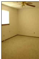
one of three other bedrooms