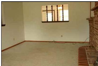
Open area into dining from living area