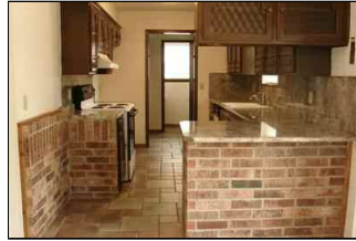
Great Kitchen with Breakfast Bar