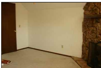
Large master with walk-in closet