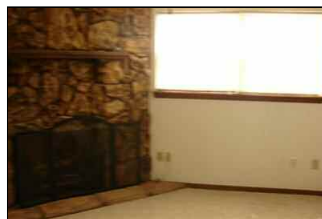
great lighting in the master