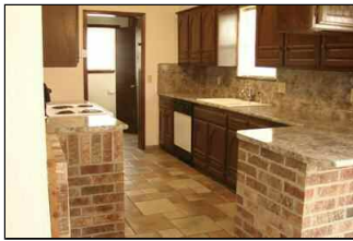
Brand new stove, new counters lead into laundry and 1/2 bath