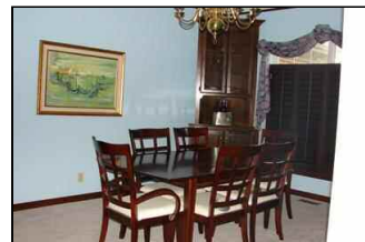
nice large formal dining area