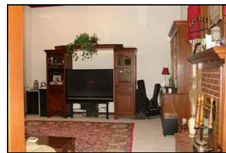
Large open living area