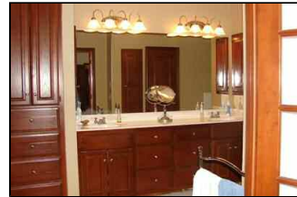
Beautiful Master bath area