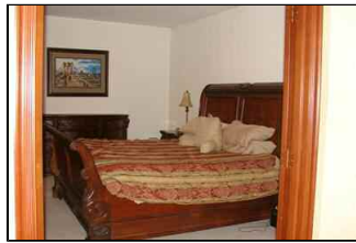
Looking into master area