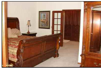
door to master