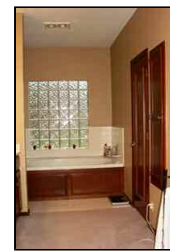
bathroom Whirlpool tub