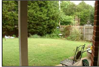
Park-like setting in front and back