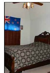
Large front bed room access to bathroom