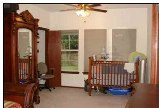
Extra space in Master