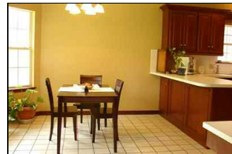
well lighted eating area