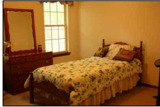
Middle bedroom with walk in closet

Your Hometown Realtor, Finding you a place to call HOME!