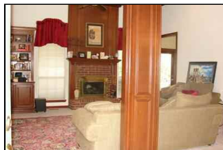
Looking in from front door