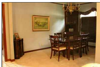
lots of room for several guests