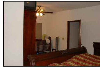
Front of Master