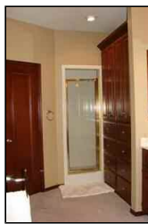
Master Shower area