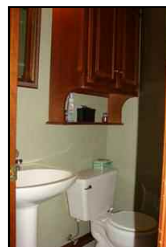
remodeled 1/2 bath