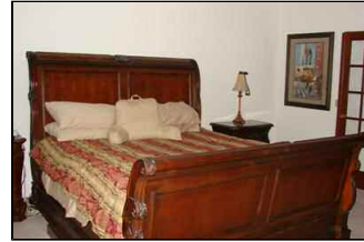
Room for a very big bed