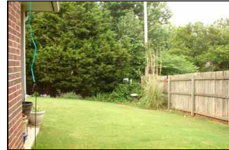
great back yard