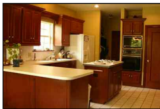
Room to cook those favorite recipes