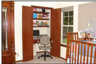
extra space in Master very flexible