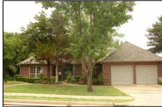
2424 Redvine 015

Your Hometown Realtor, Finding you a place to call HOME!