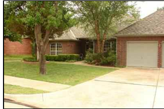
2424 Redvine 016