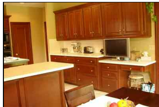
a Cook's dream kitchen